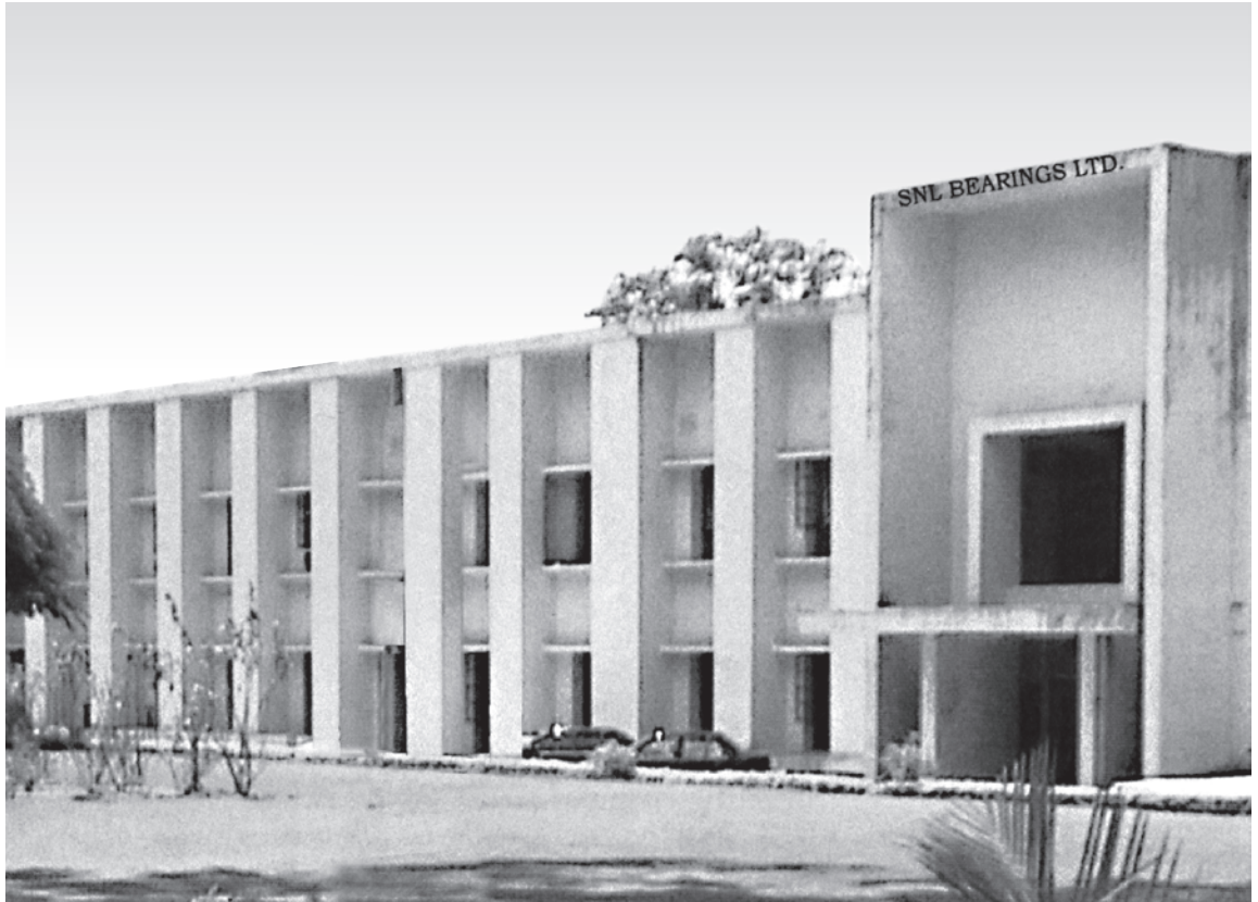
SNL Factory Building at Ranchi