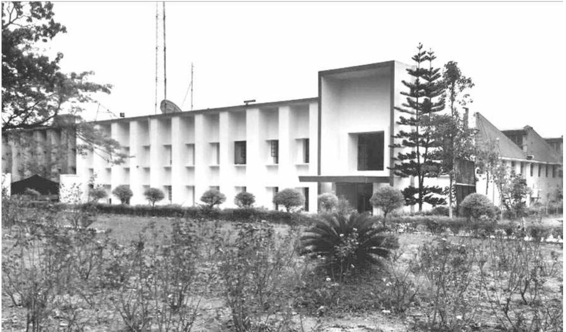
SNL Factory Building at Ranchi