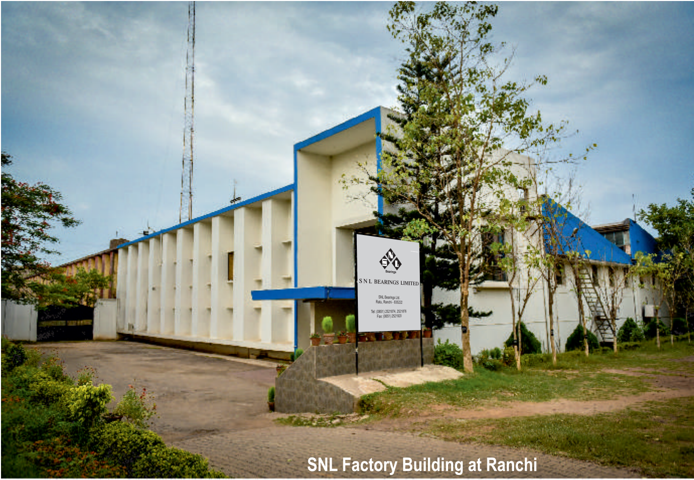
SNL Factory Building at Ranchi