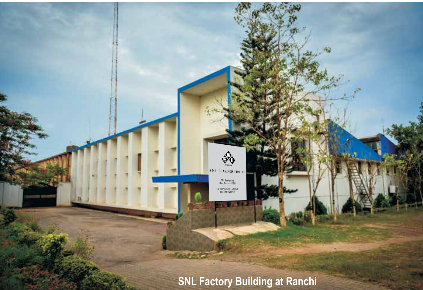
SNL Factory Building at Ranchi